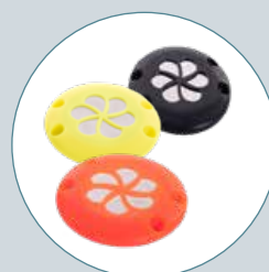
Taler black, yellow, orange