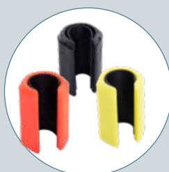
Held black, yellow, orange

Do you use a walking stick or crutches? And sometimes the walking aid falls to the ground? Bending down is strenuous and wobbly. You could fall. This is where our magnetic cane holder Held and the magnetic Taler help: you can attach your walking aid to your trousers, for example.