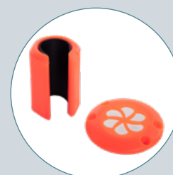
Held/Taler set black, yellow, orange