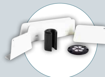
Held complete set

Products may differ from illustrations, version 11/2022