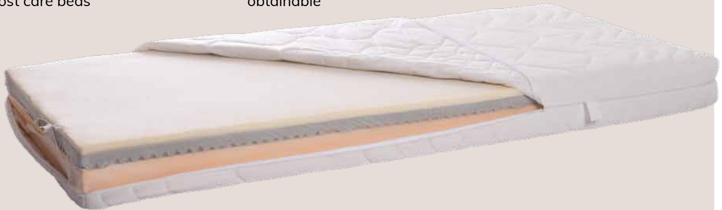
Cosy and soft

in standard and special sizes obtainable