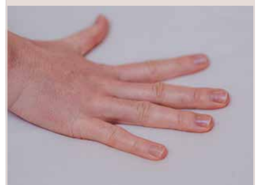
Skin friendly cover