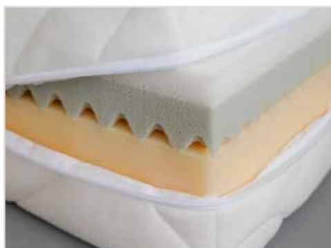
Three foam layers for extra high comfort