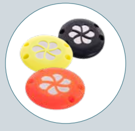
Taler black, yellow, orange