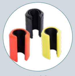
Held black, yellow, orange

Do you use a walking stick or crutches? And sometimes the walking aid falls to the ground? Bending down is strenuous and wobbly. You could fall. This is where our magnetic cane holder Held and the magnetic Taler help: you can attach your walking aid to your trousers, for example.