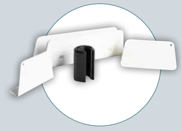
Held set for indoors

The Held complete set consists of a magnetic cane holder, a Taler for on the go and three self-adhesive metal adapters.