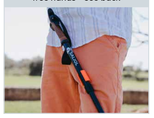
Useful accessories for free hands - see back