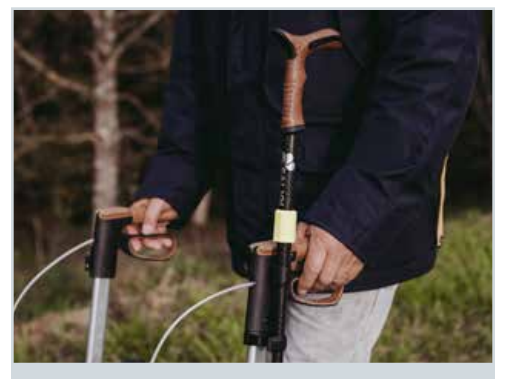
Elegant and practical like all Saljol products