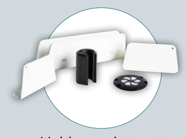
Held complete set

Products may differ from illustrations, version 11/2022