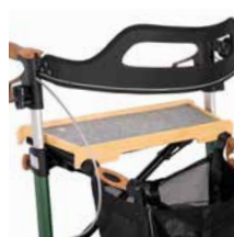
Wooden tray with felt pad