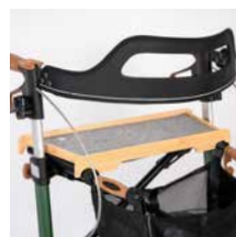
Wooden tray with felt pad