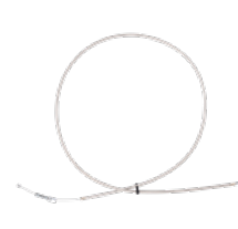
Brake cable for the conversion to one-hand brake