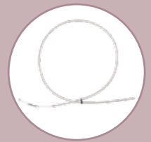
Conversion set for one-hand simultaneous brake