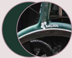
British Racing Green