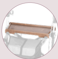
Real wood tray