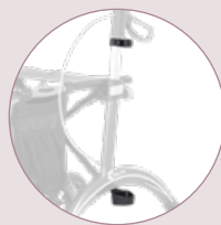
Additional cane holder