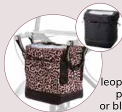
Designer bag from JOST